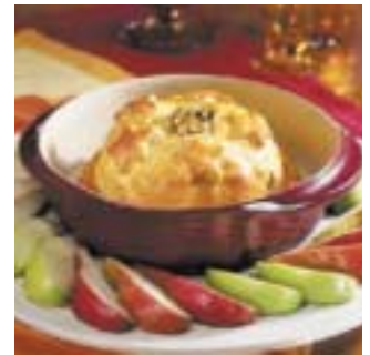
Pampered Chef mini baker