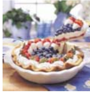
Pampered Chef deep dish pie plate

Spread the word by sharing this information with your entire contact list. We hope everyone will join in.