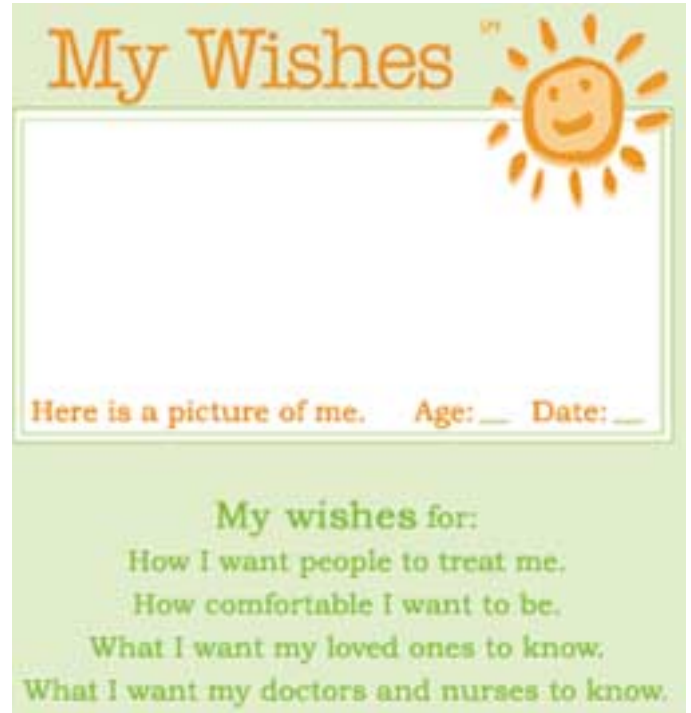
My Wishes document provided by Aging with Dignity, a non-profit whose mission is to safeguard the human dignity of those who are seriously ill.

"I wish to be cared for with kindness and cheerfulness; I wish to