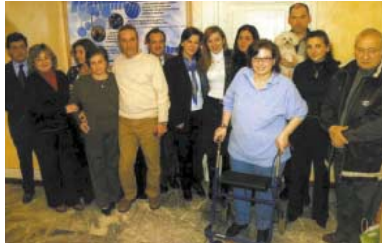
Members of AISNAF at their first meeting in Rome, Italy in April 2007.

AISNAF was recognized as a non-profit by the Italian government in March 2006. Twelve NBIA families have joined the association, and six others have recently made contact.